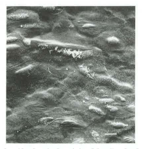
Fig. 2. – After 2 weeks the majority of the cells cultured as a monolayer are non-ciliated cells but some ciliated cells remain present (SEM). Bar = 10 \mu m.

Fibroblast contamination is not a major problem in respiratory epithelial cell cultures. It is reduced by low temperature [6, 27] enzymatic dissociation, for which pronase is usually chosen, and it can be reduced further by a preplating procedure in which the fibroblasts attach before the epithelial cells [8, 9, 34, 51], by serum-free culture media and by a culture temperature of 33°C instead of 37°C [20].