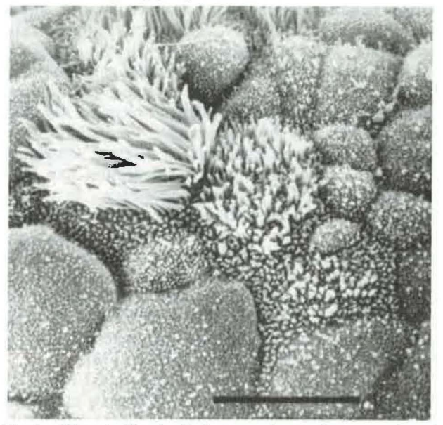
Fig. 4. – When deciliated cells from monolayer cultures are released in suspension, aggregates, vesicles and spheroids are formed and after 1 week ciliated cells reappear. After 2 weeks in suspension ciliated and non-ciliated cells are present as well as cells in the process of ciliogenesis (SEM). Bar = 10 \mu m.

Before this system can be accepted as a complete model for differentiation of respiratory epithelium it still has to be shown whether there is production of mucins or of mucin-like glycoproteins.