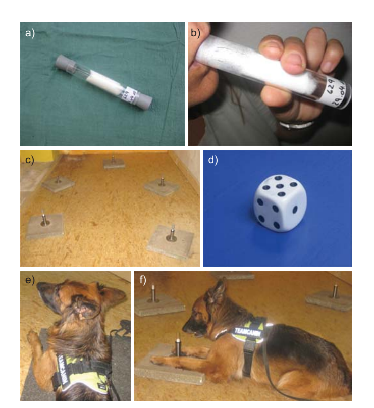
FIGURE 2. Applied methods for breath sampling and testing. a) Glass tube used for breath sampling. The lumen is filled with the polypropylene fleece. b) For breath sampling, study participants exhaled five times through the collection device. c) Test set-up showing the probe retainers. d) The position of the lung cancer samples was randomised. e) Sniffer dogs were trained to identify lung cancer in the breath sample of patients. f) The dogs were trained to indicate a positive test tube by lying on the floor in front of the tube with the muzzle touching the test tube.

no significant statistical difference regarding their constitution. As a consequence of the training strategy (applying breath samples of groups A and B, but not C), the sample age of group C was significantly less.