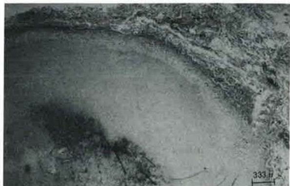
Fig. 2. - A nodular lesion showing central necrosis with calcifications surrounded by a dense fibrous tissue. The alveolar architecture is almost preserved (haematoxylin and eosin).