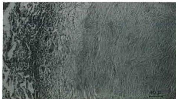
Fig. 3. - Higher magnification of the periphery of the nodule showing, outside a dense fibrous tissue surrounded by an inflammatory reaction made of lymphocytes, some plasma cells and a few giant cells (haematoxylin and eosin).